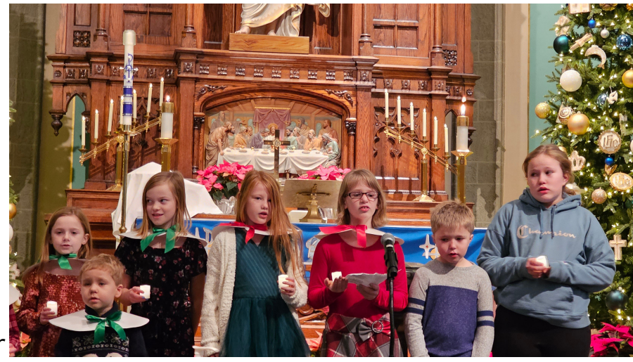
The children from the Sunday School program presented a play at the worship service on December 17th.